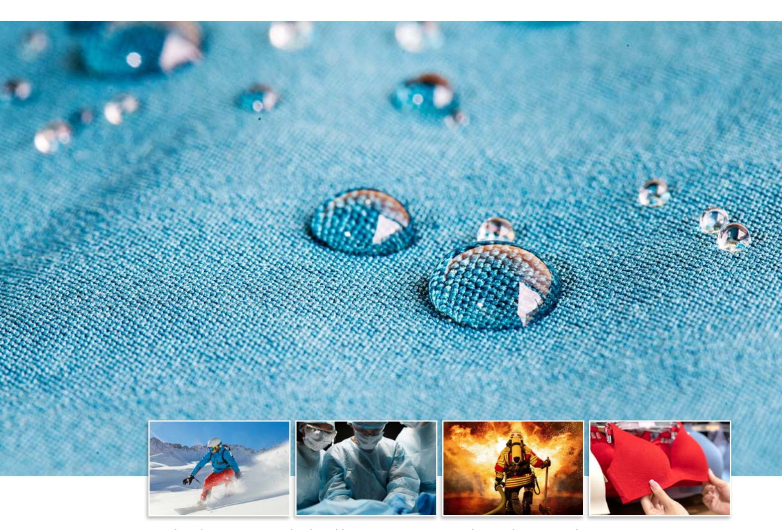
Outdoor/sportswear, medical and hygiene, protective workwear, lingerie and swimwear